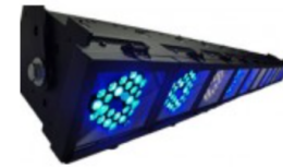
Strip Light (LED)