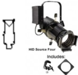
Source 4 Ellipsoidal