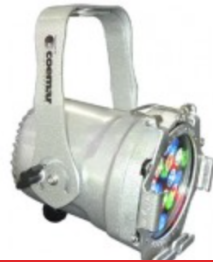
Par Light (LED)